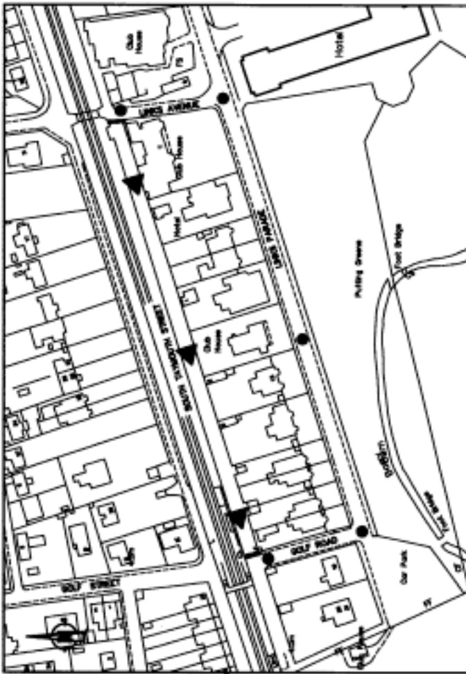
SOUTH TAYMOUTH STREET CARNOUSTIE - ONE-WAY TRAFFIC