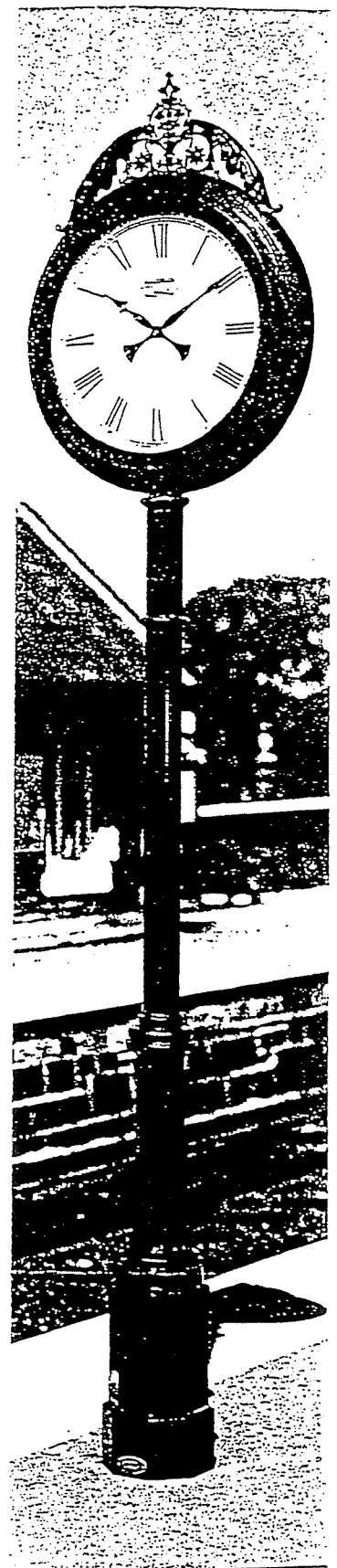
ATSF CL 12 Street clock H: 3670 Width 750 Base 250 x 250