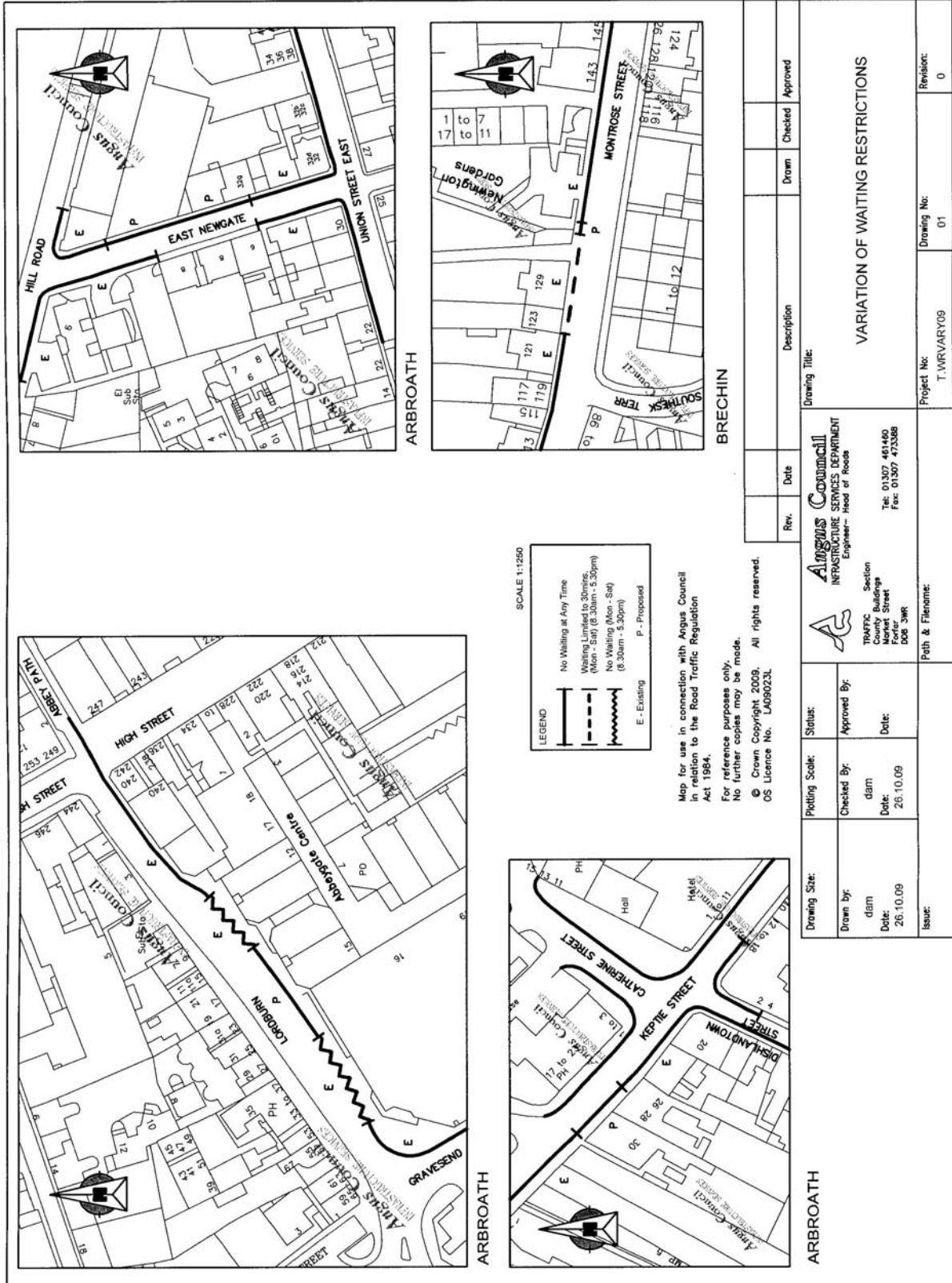
Variation of Waiting Restrictions